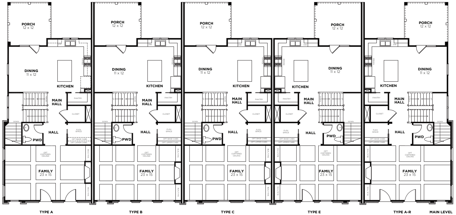
TYPE A TYPE B TYPE C TYPE E TYPE A-R MAIN LEVEL